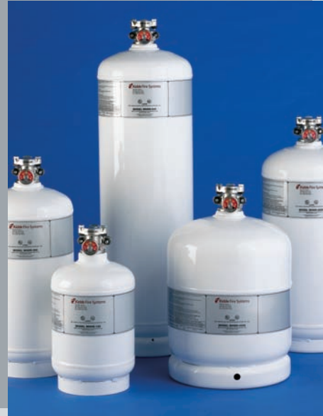
Kidde WHDR System

Investing in a Kidde WHDR System guarantees more than compliance with UL Standard 300, NFPA 96, NFPA 17A and insurance codes—it provides protection from the devastating consequences of a fire.